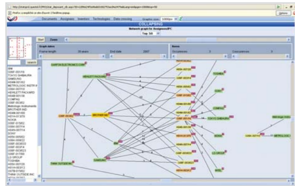
Network Graph for Assignees/IPC

Identify and analyze trends, market share, technology shifts